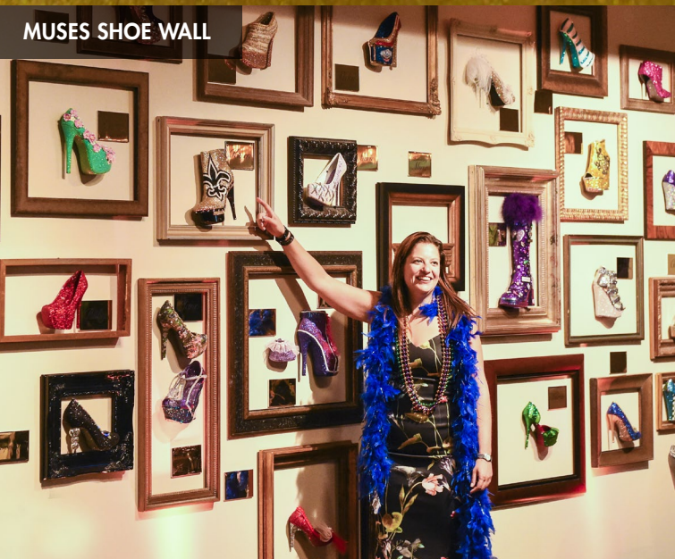
MUSES SHOE WALL