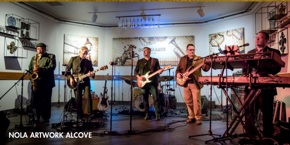
NOLA ARTWORK ALCOVE