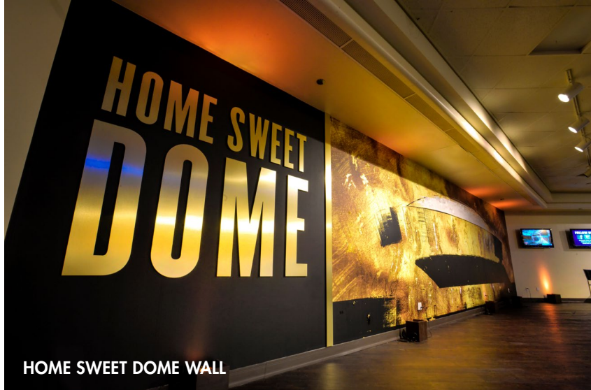
HOME SWEET DOME WALL