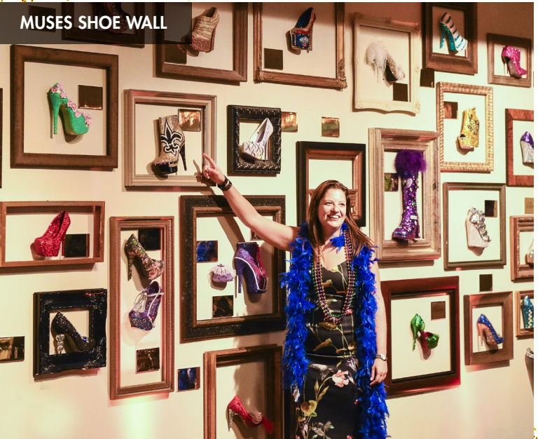
MUSES SHOE WALL