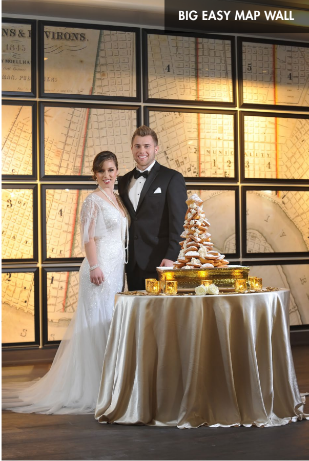
BIG EASY MAP WALL