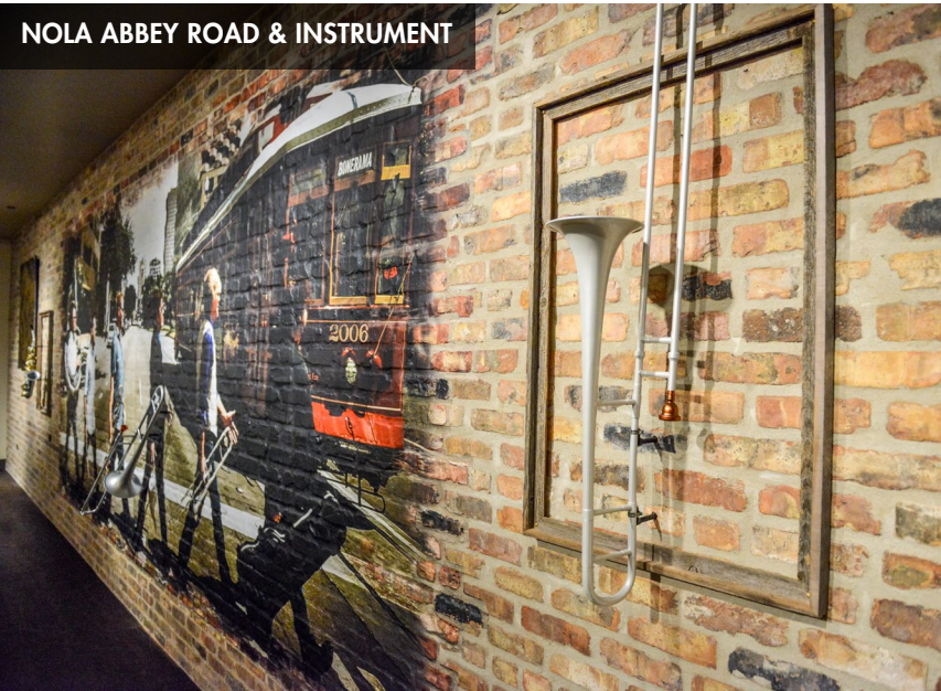
NOLA ABBEY ROAD & INSTRUMENT