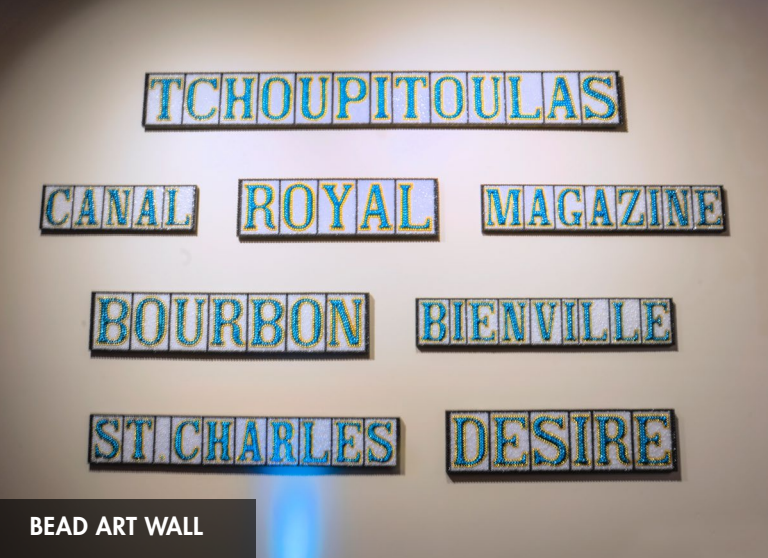
BEAD ART WALL