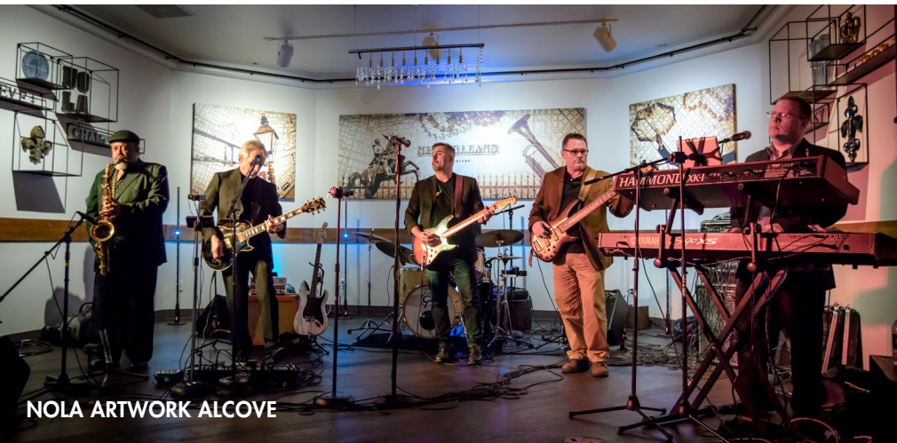
NOLA ARTWORK ALCOVE